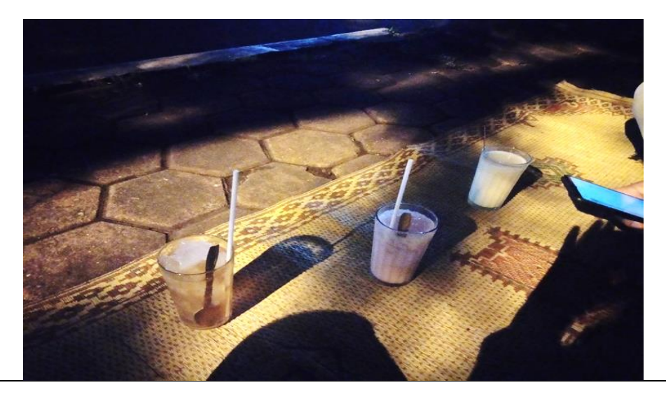
Figure 2. Teacher's photovoice (iced coffee): real facts of online teaching and teacher's online teaching strategies

In this online teaching, I felt I got karma from the cartoon Dora the Explorer. When I watched it, I said "This cartoon is strange, she asks, and she answers the questions by herself". And, wow, I am like a Dora right now in this online teaching. Sometimes, I ask a question and I answer my own question because my students don't answer it. The main problem with online teaching is "communication", it is very difficult to communicate with the students because of the network. Not only that, but sometimes when I give instructions, the students do not pay attention to the learning and just keep silent. When I give them assignments, just 20 % of the students submit the assignment, the rest of them just phantom students. I always try to make the learning process interactive by providing fun learning and making the students comfortable with the learning, however, it doesn't work at all. I use quantum learning as my strategy to teach English. First, I motivate the students, then I make the students feel comfortable and I make some models of learning that are enchanting (based on me) such as using voice notes to speak English and I make some videos so the students will have a better understanding, after that I evaluate the learning process and give them appreciation but all those activities are done in an online way.