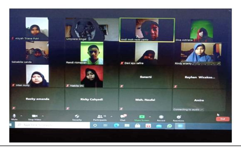
Figure 3. Teacher's photovoice (The look of Zoom in online teaching): the importance of effective teaching platforms and the use of icebreaking

Ice-breaking activities in online teaching can increase students' motivation to learn and develop their relationships. However, there are some students not wanting to take part in this activity. It may be that they do not know about the rules or are not confident to join it. If they were asked why they didn't join the activity, they only smiled. Even some of them did not activate their cameras in Zoom meetings/Google Meet, so they did not participate in the ice-breaking activities. The reason was that the internet connection was not good. Consequently, the ice-breaking activities selected should be the ones that can optimize the online teaching-learning process.