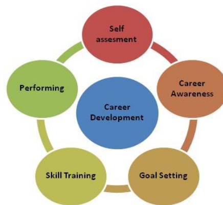
Figure 1. Career development process [22]

Career pathway refers to an organized approach for career planning by charting a course to identify occupational interests, determine education and training needs, and establish an action plan for reaching career goals [22]. Creating a career pathway begins by evaluating the current state of career awareness and readiness. Identifying a potential career opportunity based on interests, skills, work experiences, and work values are the motivation behind this evaluation. Work values (such as working conditions and potentials of job advancement) are worth identifying because of their connections to career satisfaction. After pinpointing a specific career choice, a reasonable, workable pathway needs to be ascertained with the help of appropriate resources. Figure 1 shows the components of the career development process [23]-[26].