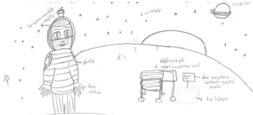
Figure 3. Drawing and explanation belonging to S20

It was also found that 26 students out of 77 students have the astronaut mental model. In all the drawings evaluated in this category, students depicted a scientist in astronaut clothes conducting research on a kind of heavenly body. Some examples of the astronaut mental model found to be possessed by students are given below.