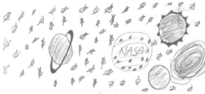
Figure 6. Drawing and explanation belonging to S17 A person who explores the heavenly bodies in the space

The findings of the study revealed that while 36 out of 77 students have the scientific mental model, 39 have the synthesis mental model. In their explanations, the students associate the concept of astronomer with different concepts aside from “profession”. The other concepts with which they associate the concept of astronomer most frequently are astronomy (13) and astronaut (26). Thus, it can be contended that the students confuse the concepts of astronomer, astronomy and astronaut. This finding concurs with the findings reported by Arı Kurt et. [22]. Of the 77 students participating in the study, 26 drew an astronaut in their drawings. In the astronaut mental model, students depicted a scientist in astronaut clothes conducting research in the space. In the 2013 science curriculum, the unit “The Solar System and Beyond” is the last unit. Thus, this unit may not have been studied efficiently and as a result the students may have used their prior knowledge received from extracurricular sources to explain the subjects. Some amendments were made on the 2017 science curriculum and now this unit is studied as the first unit of the fall term.