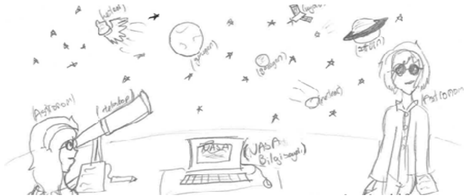
Figure 1. Drawing and explanation belonging to S73

The students having the scientific mental model are knowledgeable about the definition and characteristics of the concept of astronomer and reflected this in both their verbal explanations and drawings. When the drawings of the students included in this category are examined, it is seen that the students are of the opinion that the astronomer explores the movements and structures of celestial bodies by using the telescope and technological devices (e.g. computer). Moreover, some students pointed out that the astronomer conducts his/her observations in observatories. Some examples of students' scientific mental model are presented in Figure 1, Figure 2, Figure 3, Figure 4, Figure 5, Figure 6.