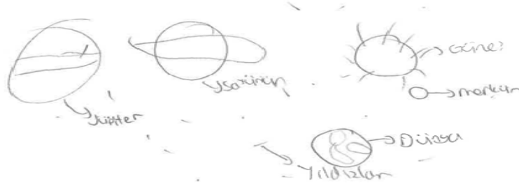
Figure 5. Drawing and explanation belonging to S16 Space, sky, start, moon.

It was determined that 13 students out of 77 students have the celestial bodies mental model. In the drawings evaluated in this category, students did not draw any human figure, they only drew different heavenly bodies. In almost all of these drawings, there is the Sun, Jupiter, Saturn, World and stars. Some examples of the celestial bodies' mental model found to be possessed by students are given below.