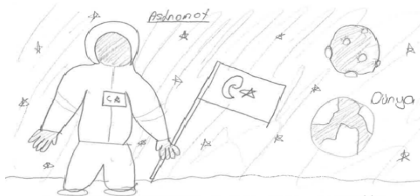
Figure 4. Drawing and explanation belonging to S21

This is one of the professions I want to have. It refers to the space. This is the repercussion of man's dream of traveling to space.