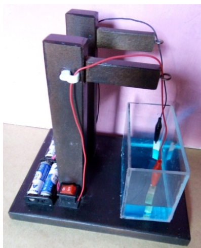
Figure 3. Electroplating Tool

Electroplating tool shows a simple electroplating process in Kotagede, in silver handicraft industry. The principle of electroplating is that the coated metal treated as a cathode which connected with a negative pole and the coating metal treated as anode which connected with the positive pole.