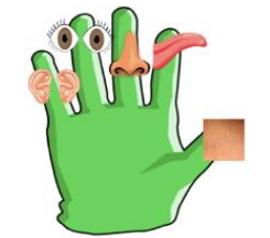
Figure 1. Story glove for day 1